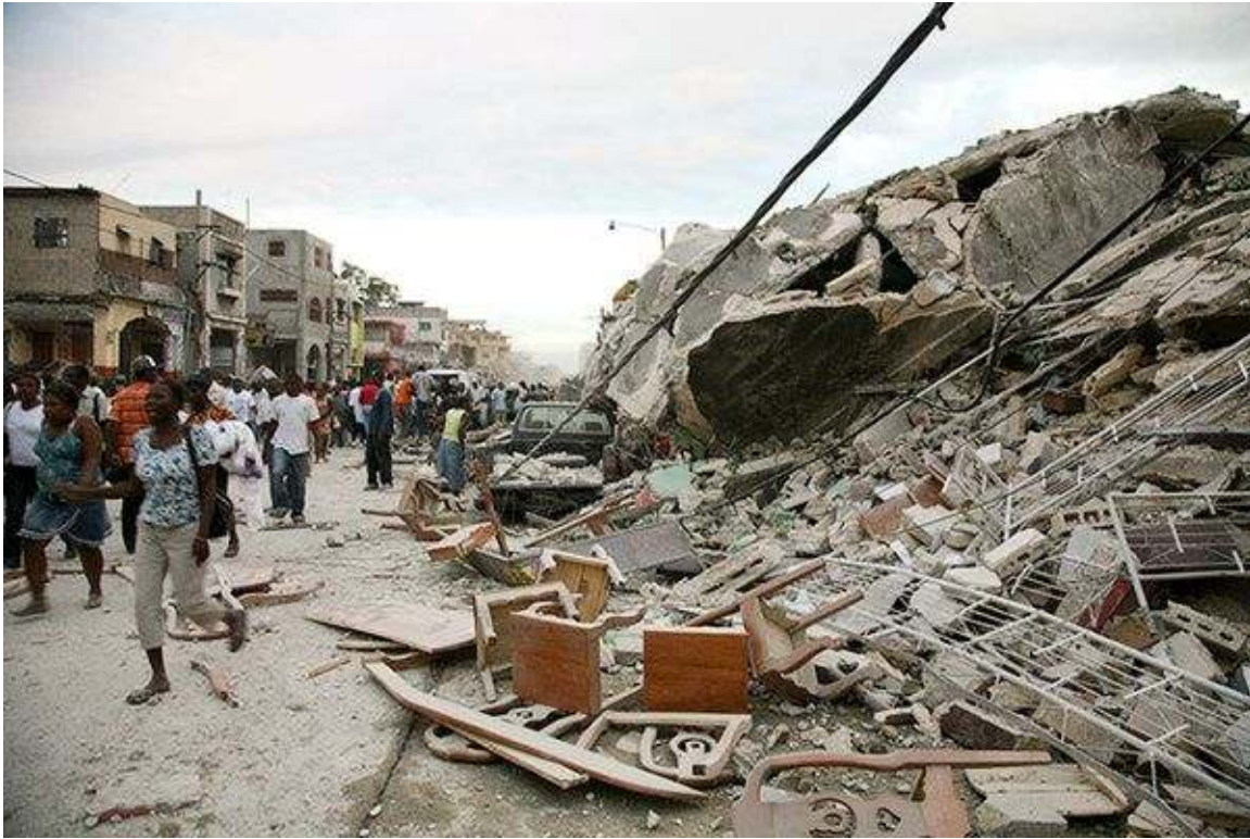
Picture of the devastation in Haiti.

Sources: CNN.com ; Nationalgeographic.com ; Wikipedia.com