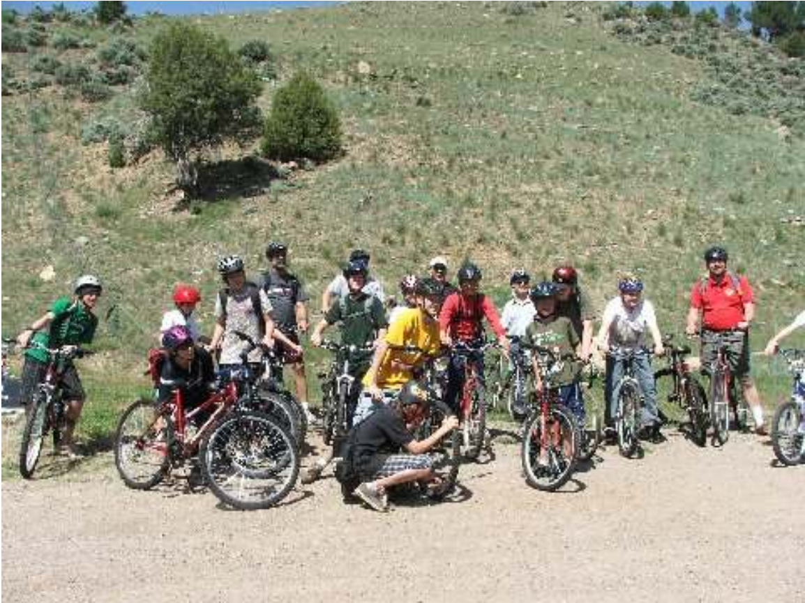
Bike Ride through Glenwood Canyon.