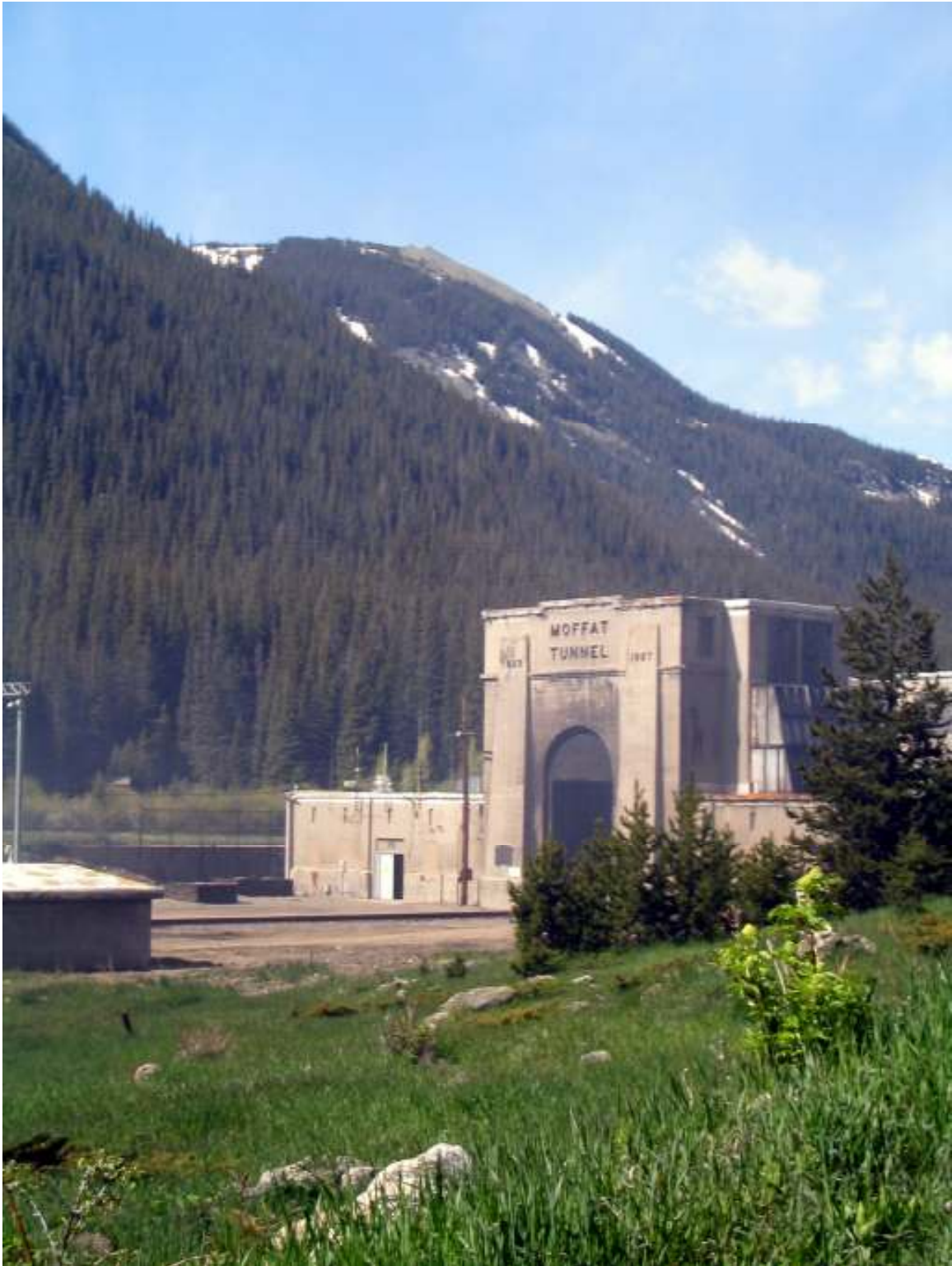
The eastern entrance to the Moffat Tunnel